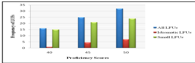
FIGURE 3. Correlation of proficiency scores and all and two main subcategories of LF

As mentioned in the preceding section, this study utilises Ushigusa’s (2008) classification of prefabs. The use of different subsets of lexical fluency units was examined mainly because they were hypothesised to correlate with the temporal measures of fluency that appear largely linear in the previous section. There are three levels of descriptions in this section, as represented in Figure 3. The first level is the frequency of all lexical fluency units, the second level is the frequency of idiomatic lexical fluency units and literal lexical fluency units that are subsumed under the first level, and the third level is the frequency of all smaller lexical fluency units subsumed under the intermediate level.